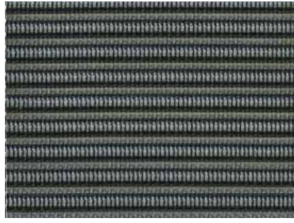
Luminesce Mesh Monofilament Stripe

pattern Monofilament Stripe Designed by Elizabeth Whelan 2004 colour Black contents 76% flame retardant Polyester and 24 % Elastic code M10