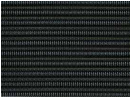
Luminesce Mesh Monofilament Stripe

pattern Monofilament Stripe Designed by Elizabeth Whelan 2004 colour Black contents 76% flame retardant Polyester and 24 % Elastic code M10